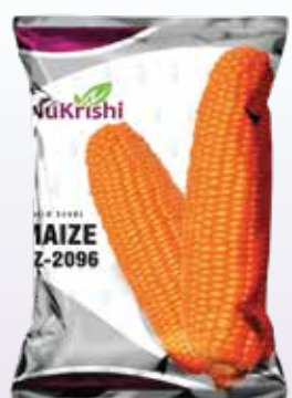
NZ-2096 Hybrid Maize Seeds