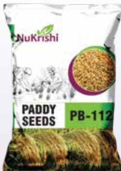
PB-1121 Paddy Seeds