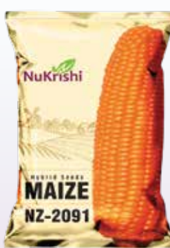
NZ-2091 Hybrid Maize Seeds