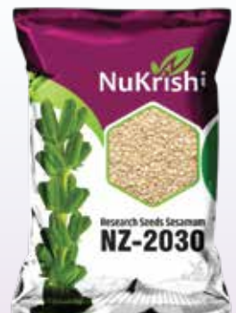
NZ-2030 Research Seeds Sesamum