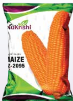
NZ-2095 Hybrid Maize Seeds