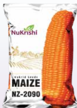
NZ-2090 Hybrid Maize Seeds