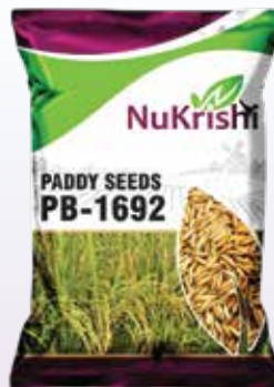
PB-1692 Paddy Seeds